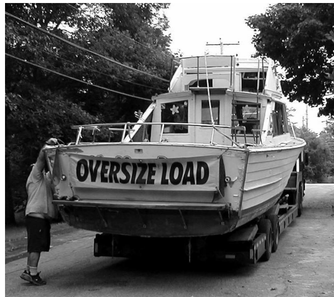
1967 CHRIS CRAFT SEA SKIFF 32'

CHRIS CRAFT, Sea Skiff, 1967, 32'. Twin Chevy gas 350s. Always in water until 3 years ago. Needs little wood work. Moving. Asking: $1000. Email: wayne-mary@cox.net (RI)