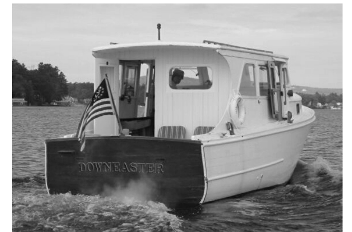
1948 MORSE CRUISER 32'

MORSE Cruiser, 1948, 32'. Downeaster, cedar & oak wood cruiser, designed & built buy WJ Morse of Thomaston, ME. Powered by a rebuilt 6 Cyl Palmer (International Havester) 135 HP gas motor. This 32' Downeaster has had only 3 owners! ...details on Page 10.