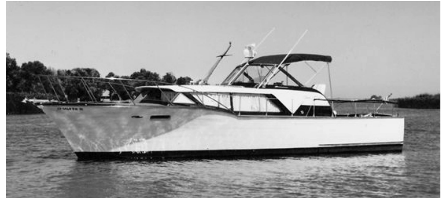
...details on Page 11.