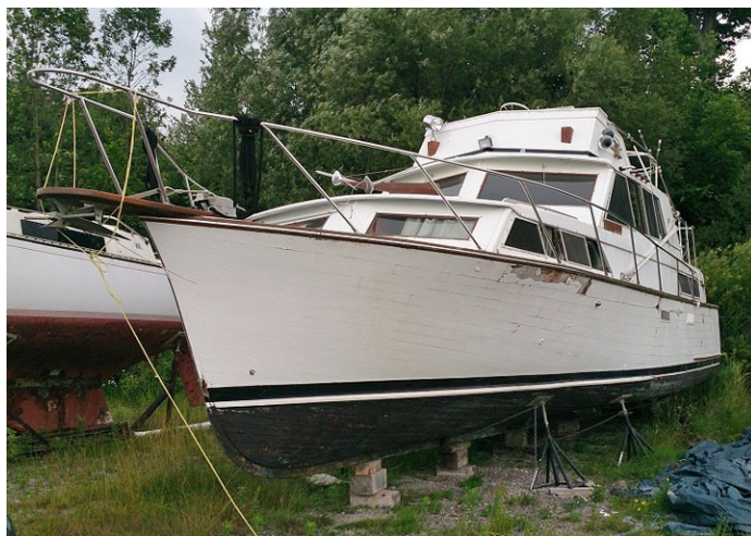
1968 PACEMAKER 38' AFT CABIN w/ FLYBRIDGE – BLACK FALCON