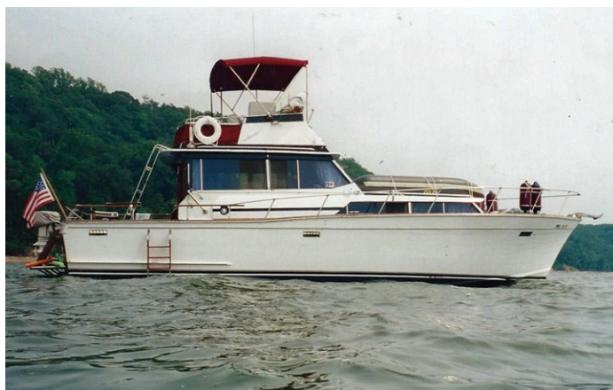
FREE BOAT: 1969 TROJAN SEDAN 36' – Details on page 2.