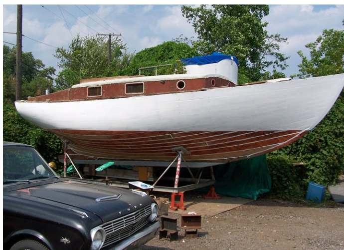
1928 Wm ATKIN SHOAL-DRAFT CUSTOM KETCH 30'